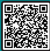
Diarrhoea and vomiting