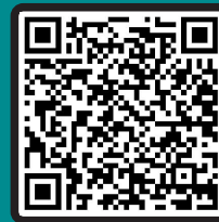
Safe sleep for babies